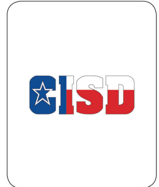
VACANT Trustee Place 1