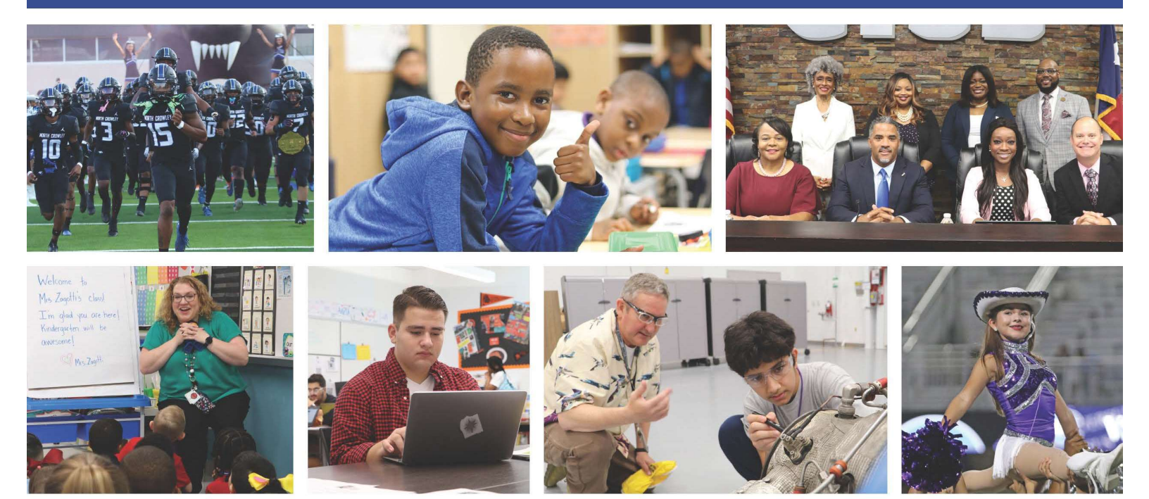
Fiscal Year Ended June 30, 2022 Crowley, Texas