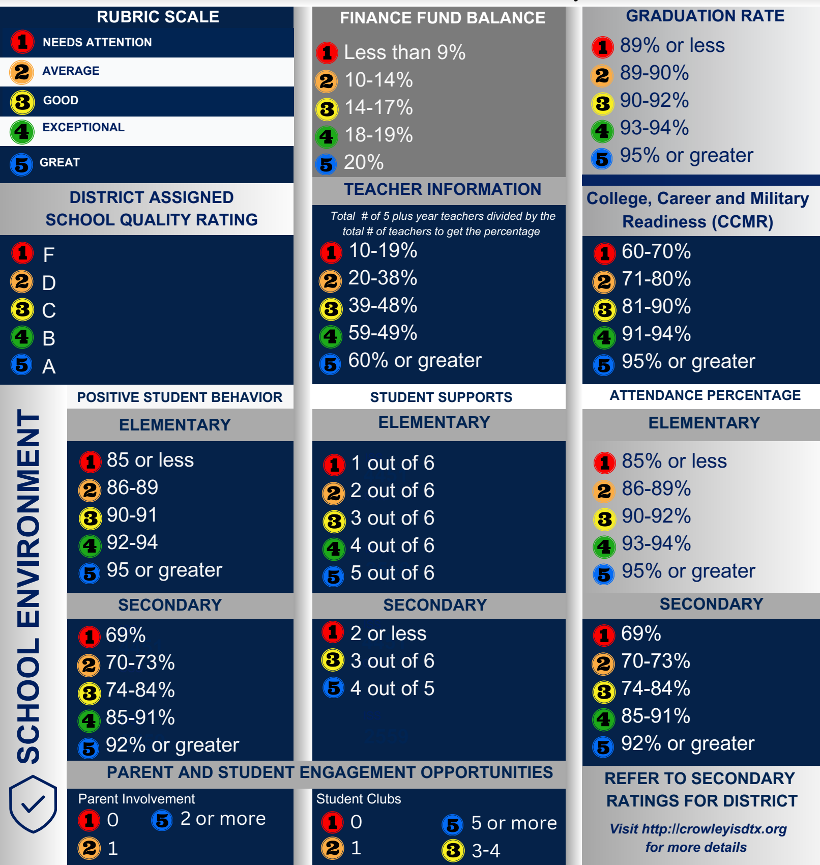
Metrics that Matter to our Community